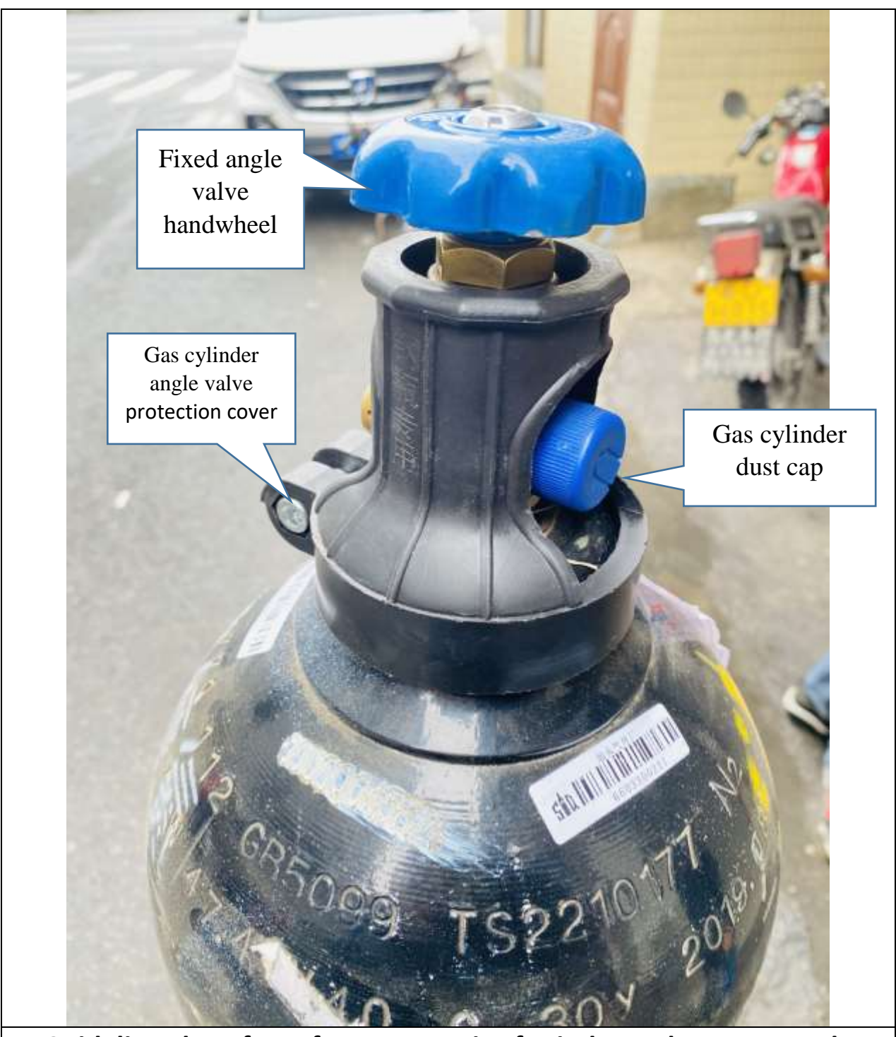
Guideline chart for safety accessories for independent gas supply cylinders in lab