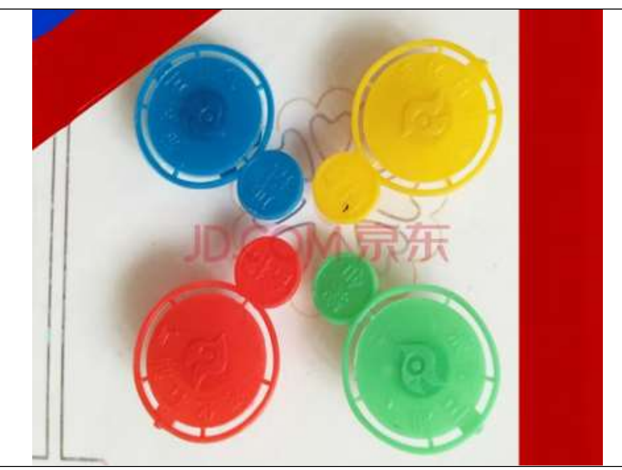
Cylinder accessories are complete and in good condition (Valve protection plug)