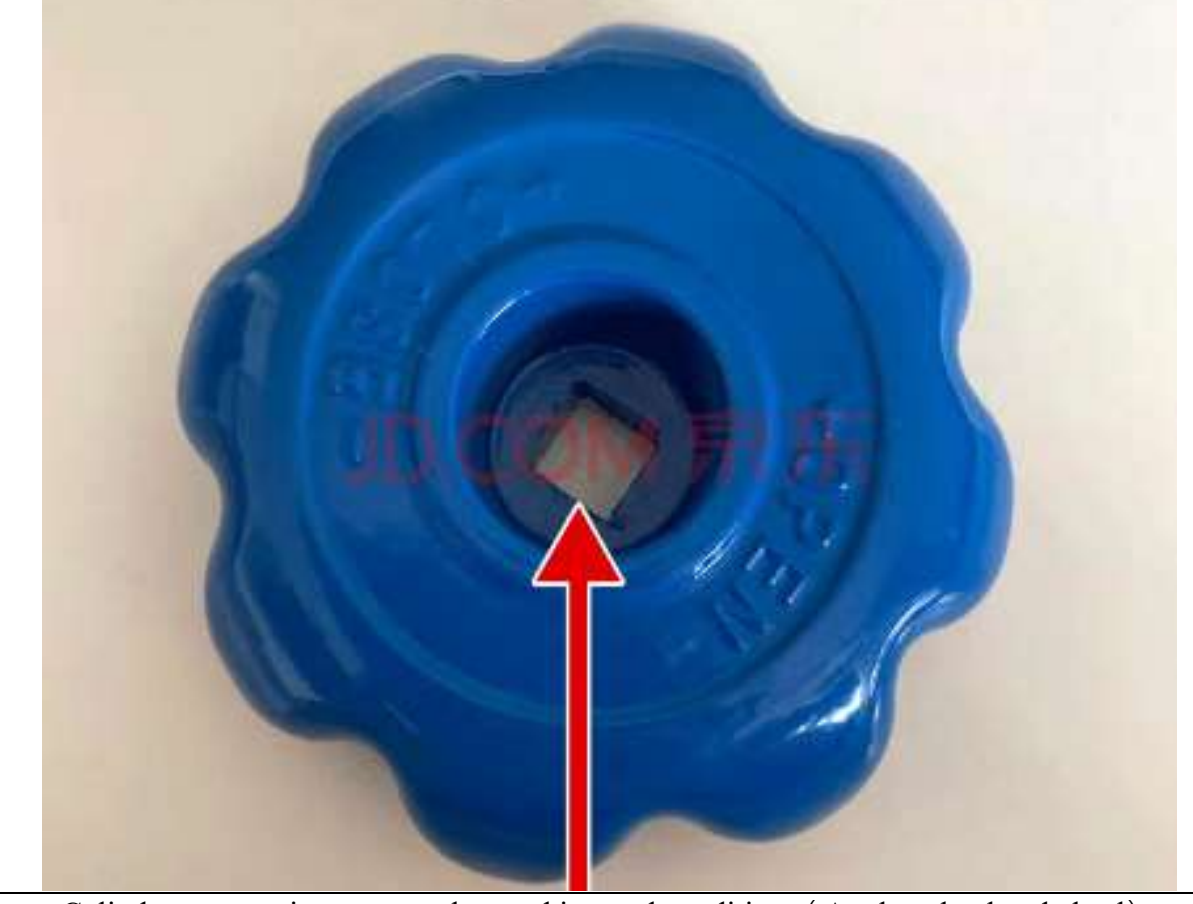
Cylinder accessories are complete and in good condition (Angle valve handwheel)