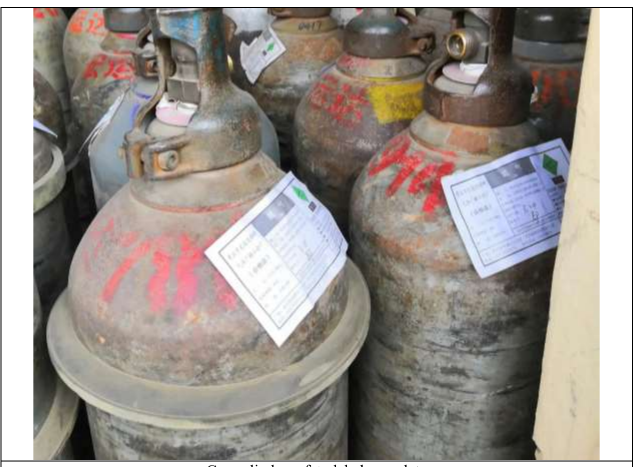
Gas cylinder safety label complete