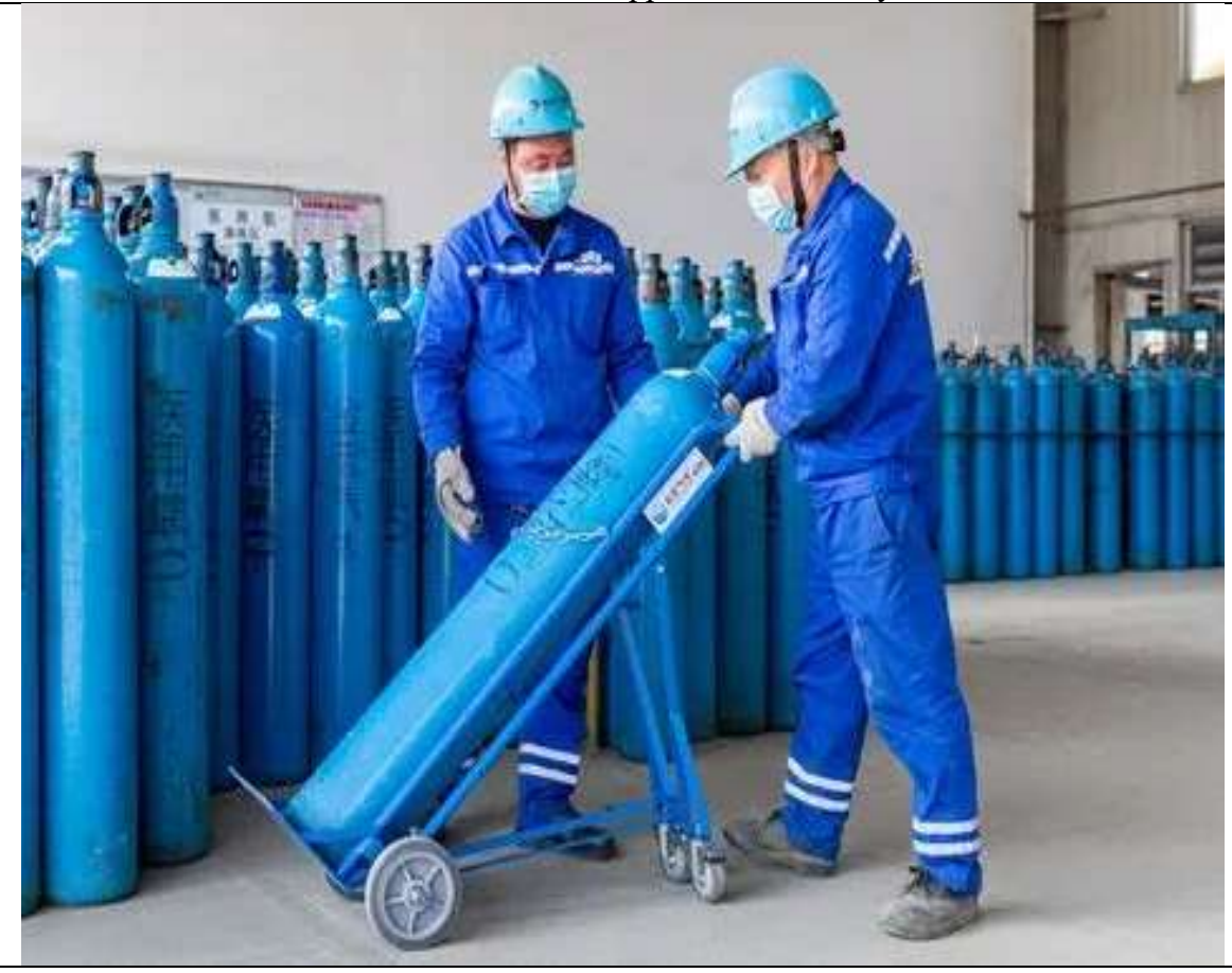
Equipped with gas cylinder transportation tools (gas cylinder special cart)

No obvious defects in the appearance of the cylinders